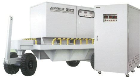
Ground Military Units 500VA - 300kVA