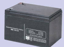
Sealed & Semi-Sealed Batteries