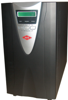
Tower 1kVA - 10kVA