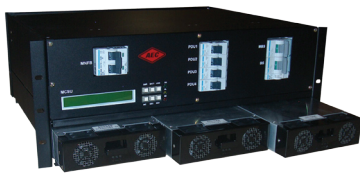
Switch Mode Rectifiers for all applications