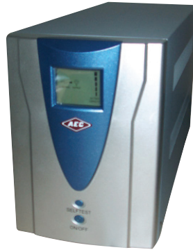
Pure Sinewave 1kVA - 3kVA