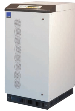
Transformer Based 20kVA - 3.6MVA