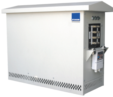
Electronic with Isolation Transformer From 15kVA upwards