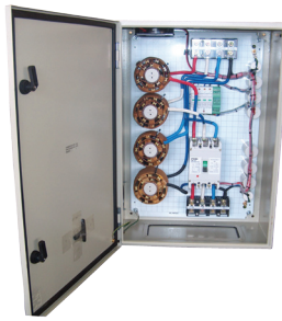
Industrial Surge Panels 60A - 800A