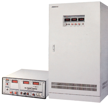
1 Phase & 3 Phase 500VA - 300kVA