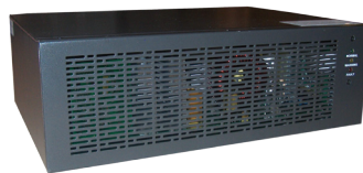
240Vdc Battery Chargers, 8A & 12A