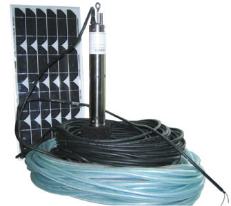
Solar Water Pumps 20M & 30M Pumping Depths