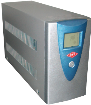
Modified Sinewave 600VA - 1kVA