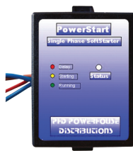
Softstarters 1 Phase & 3 Phase