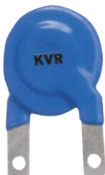
Metal Oxide Varistors