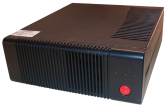
Modified Sinewave 500VA - 2kVA