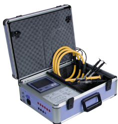
Janitza Power Quality Monitoring Products