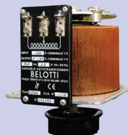
Belotti P, V & T Transformers 450W - 22kW