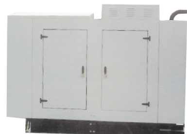
Diesel - Silent 10kVA - 2.2MVA