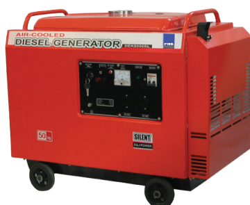
Diesel - Silent 6kVA