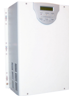
Power Inverter/Charger (Pure Sinewave) Charger up to 60A/48Vdc 1.2kVA - 13kVA