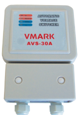
Automatic Voltage Switchers