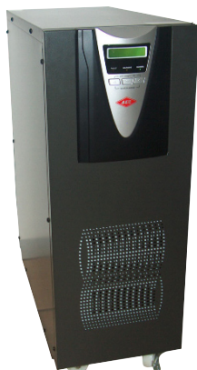
Transformerless 10kVA - 20kVA