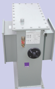
Isolation Transformers From 10kW upwards