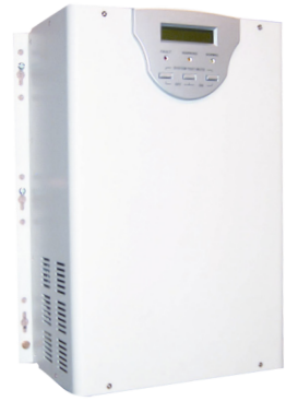
Power UPS (Pure Sinewave) Charger up to 60A/48Vdc 1.2kVA - 13kVA