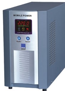
Pure Sinewave 500VA - 3kVA