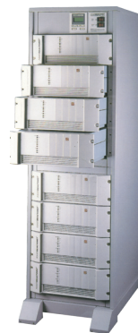
Hot Swappable 3kVA - 3MVA