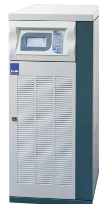
Transformer Based 20kVA - 50kVA