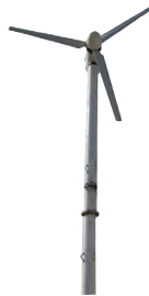
Wind Turbines Complete with Inverter 200W - 50kW