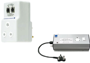
Home & Office Plug & Play Surge Protection