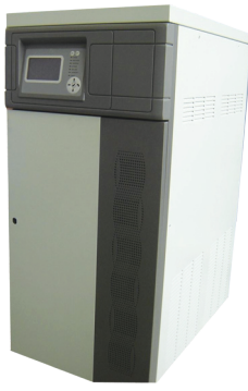
Transformer Based 10kVA - 400kVA