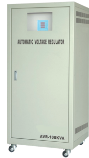
Servo - 1 Phase & 3 Phase 500VA - 500kVA