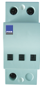
Class 1 & Class 2 Din Mount 20kA - 200kA