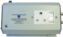
TV & DSTV Protection