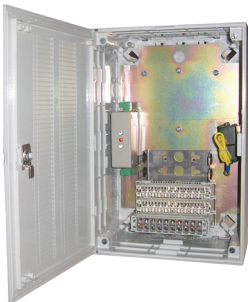
Complete PABX Protection Krone Blocks also available