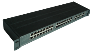
100 Base-T Protection