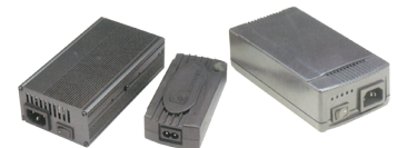
Battery Chargers 2A - 12A, 12Vdc - 36Vdc