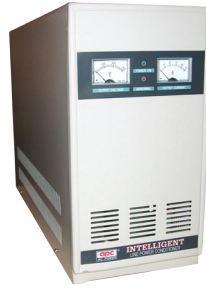
Electronic From 1kVA upwards