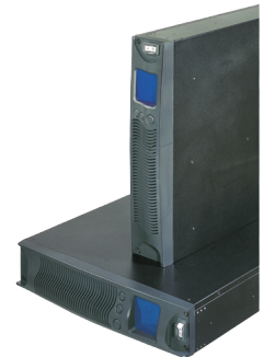
Tower & 19" Rack 1kVA - 6kVA